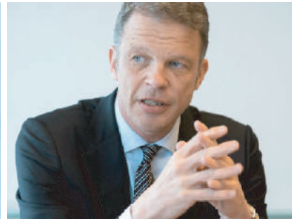
DB: Christian Sewing