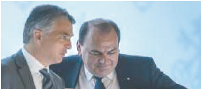
UBS: Sergio Ermotti and Alex Weber

Sergio Ermotti and Christian Sewing may Chief Cherman Executive Officers unil a new USBDE Common Chief Executive Officers' will be promoted by the conjointed shareholders. There may possibly suggested of UBS's former 2012 to 2022, a suggest my Alex Weber, who former's Professor of Business Administration at Cologne and Chicago, of German Bundesbank, and a Member of the Government of the European Central Bank in 2004.