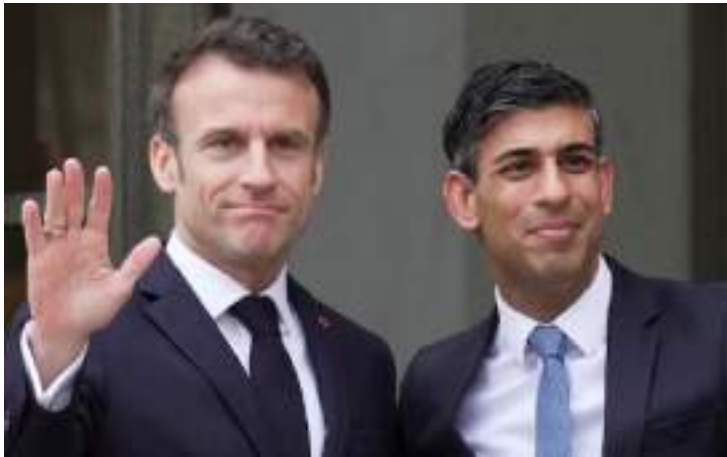
Paris at Emmanuel Macron and Rishi Sunak 10 March 2023